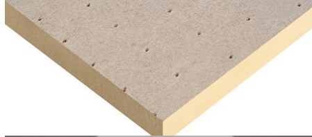
Decotherm Light beige faced boards